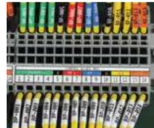
Marker Strip Label