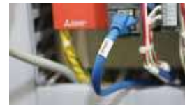
Network Cable Label