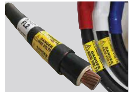
High Voltage Cable Label