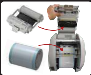
Set ribbon and tape