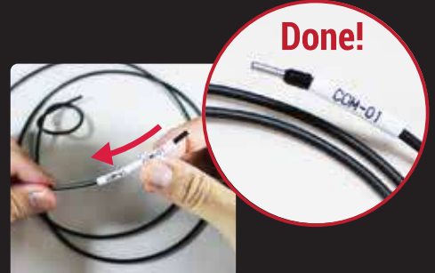
Insert, Strip & Crimp