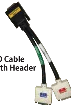
I/O Cable with Header