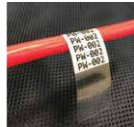
Self Laminate Label