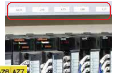
Polyester Tape Label