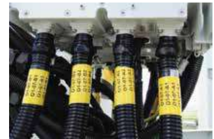
Flexible Tubing Label