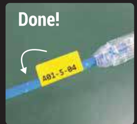
Wrap around wire