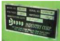
Product Specification Placard