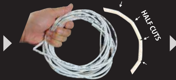
Bring the tubing to work place