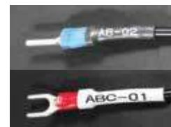
Heat Shrink Tubing