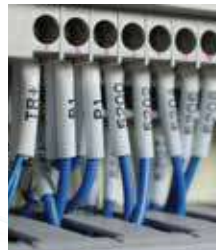
Vinyl Tubing with Half Cut Function