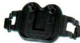
Aspirator plate Sample atmosphere prior to entry