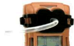
Bump/calibration plate To apply test gas to T4