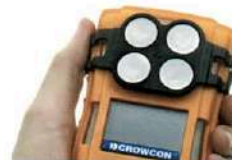
External filter plate Clip-on filter for dusty environments