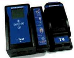
I-Test Easy automated bump testing and calibration solution