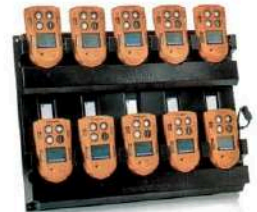
10 way charger For charging and storing your T4 fleet