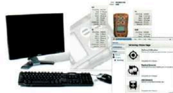
NEW Portables Pro 2.0 Software For easy configuration and servicing