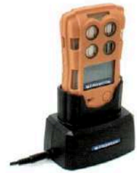
Cradle charger Docking station for easy charging