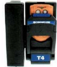
Vehicle charger Effective charging and storage whilst travelling