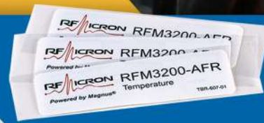
Wireless Flexible Temperature Sensor (RFID Sticker)