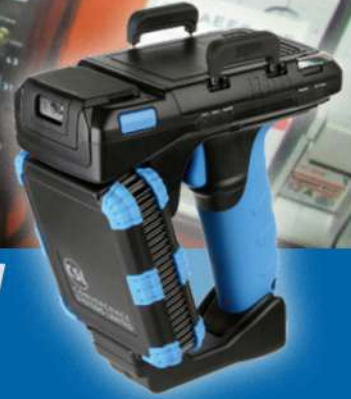
Moisture and Temperature Sensor Evaluation Kit (Portable Scanner)

Axzon brings a new approach to connecting, sensing and processing data.