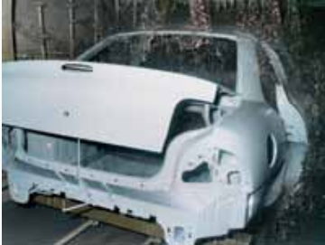
Paint & Coatings

3M Purification provides filtration and separation solutions for a wide range of industrial processes including: