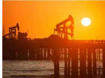
Oil & Gas Processing