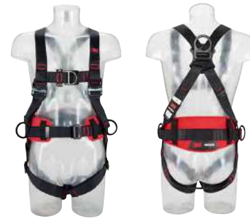
3M™ Protecta® Comfort Belt Style Fall Arrest Harness