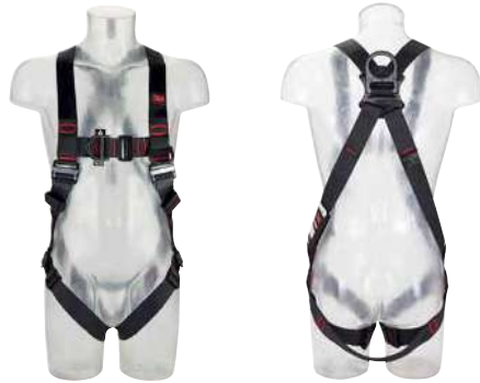
3M™ Protecta® Standard Vest Style Fall Arrest Harness