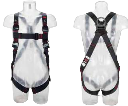
3M™ Protecta® Standard Vest Style Fall Arrest Harness