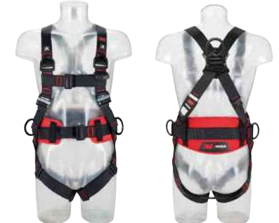
3M™ Protecta® Comfort Belt Style Fall Arrest Harness