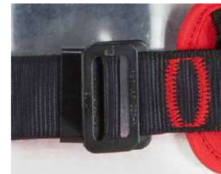
Pass through buckles