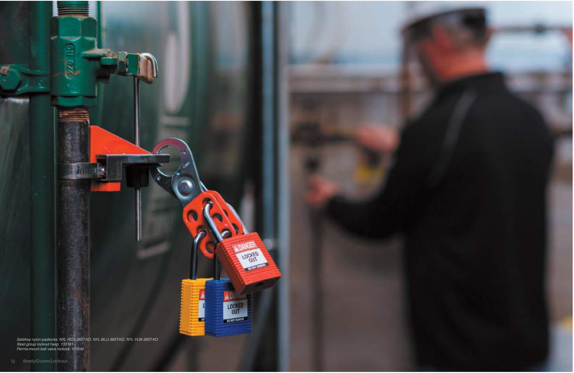
SafeKey nylon padlocks: NYL-RED-38ST-KD, NYL-BLU-38ST-KD, NYL-YLW-38ST-KD Steel group lockout hasp: 133161 Perma-mount ball valve lockout: 121540