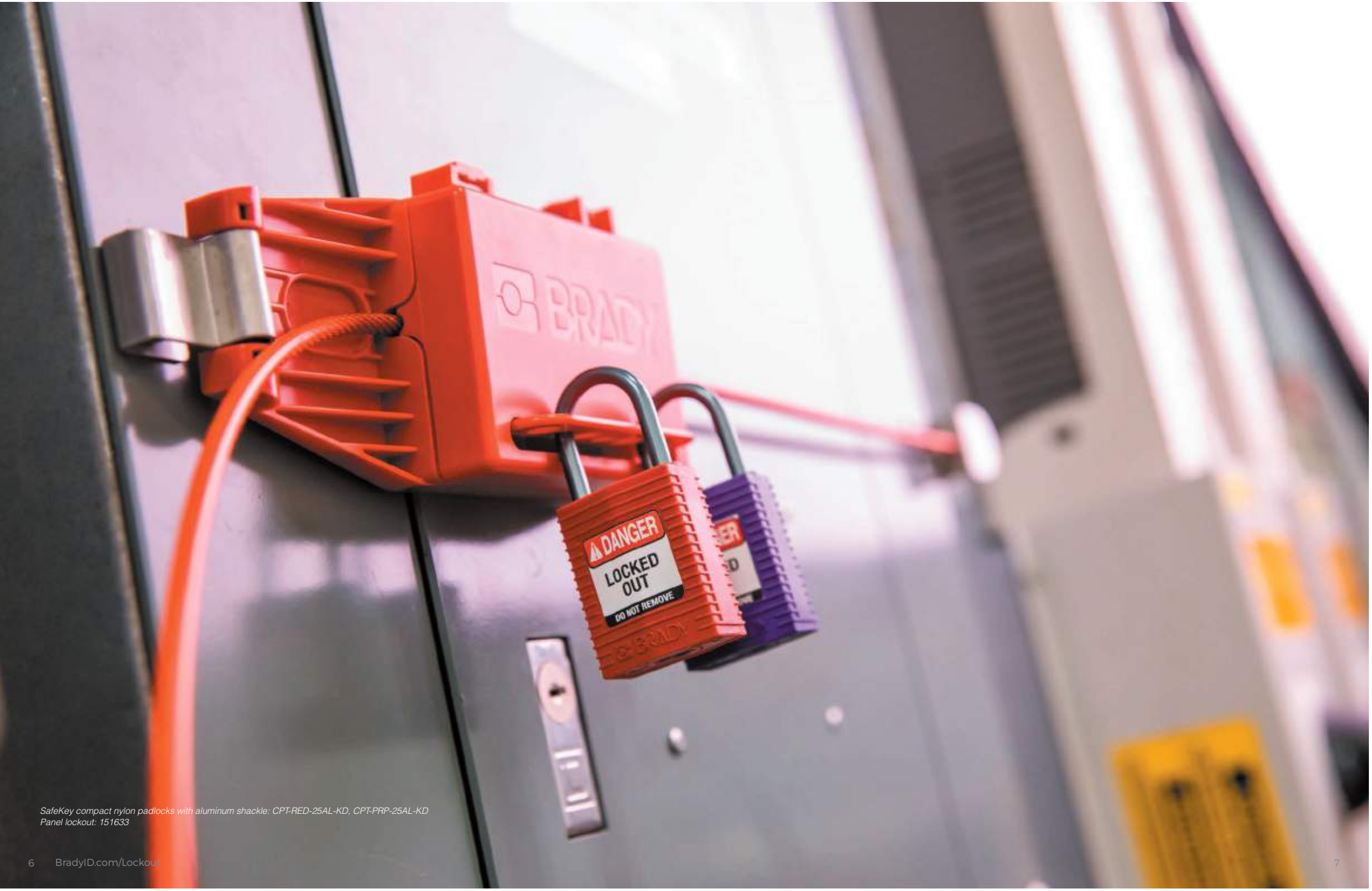
SafeKey compact nylon padlocks with aluminum shackle: CPT-RED-25AL-KD, CPT-PRP-25AL-KD Panel lockout: 151633