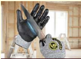
CUT RESISTANCE LV 5