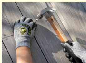
Knock, Crush, Puncture, Tear, Abrasion, Heat, Cold, Chemical, UV