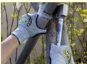
FIT LIKE BARE HANDS