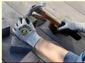
STRONG & FLEXIBLE