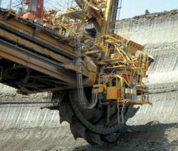
MINING AND MINERALS