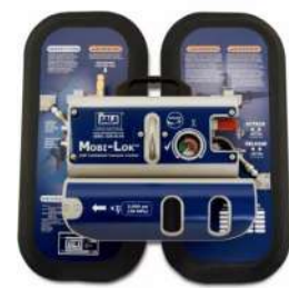
3M™ DBI-SALA® Mobi-Lok™ Vacuum Anchor with Air Bottle Attachment Learn more