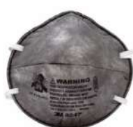
3M™ Particulate Respirator 8247, R95, with Nuisance Level Organic Vapor Relief Learn more