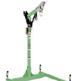
3M™ DBI-SALA® Confined Space 5-Piece Davit Hoist System Learn more