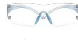
3M™ SecureFit™ 300 Series, SF301SGAF-LBL Learn more