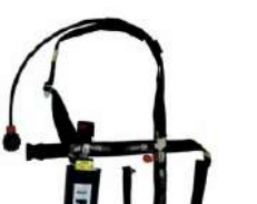
3M™ Scott™ Flite COV Airline Breathing Apparatus Learn more