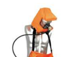
3M™ Scott™ ELSA Emergency Life Support Apparatus Learn more