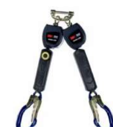
3M™ DBI-SALA® Nano-Lok™ Twin-Leg Self-Retracting Lifeline 3101719 Learn more