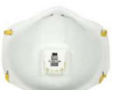
3M™ Particulate Respirator for Welding 8515, N95 Learn more