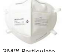
3M™ Particulate Respirator 9502+, N95 Learn more