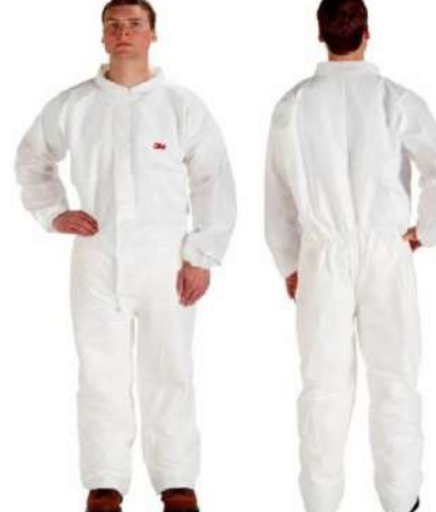
3M™ Disposable Protective Coverall 4510 Learn more