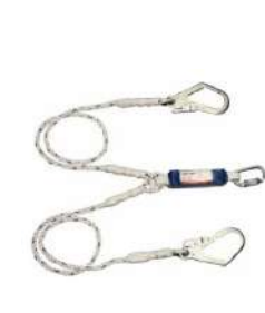
3M™ Protecta® First™ Twin Leg Shock Absorbing Rope Lanyard 1390398 Learn more