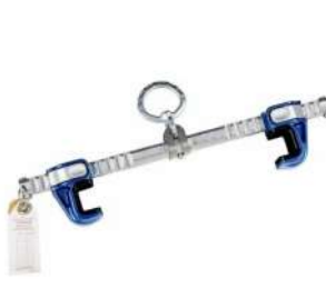
3M™ DBI-SALA® Sliding Beam Anchor 2104710 Learn more