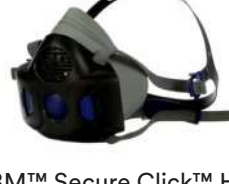
3M™ Secure Click™ Half Facepiece Reusable Respirator with Speaking Diaphragm HF-802SD Learn more