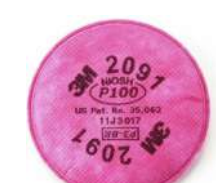
3M™ Particulate Filter 2091 P100 Learn more