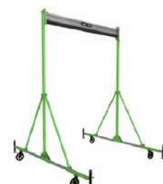
3M™ DBI-SALA® FlexiGuard™ A-Frame System Learn more