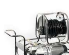
3M™ Modulair Airline Trolley System Learn more