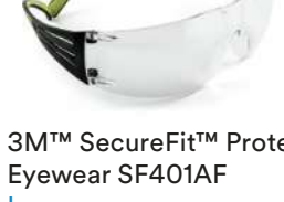
3M™ SecureFit™ Protective Eyewear SF401AF Learn more