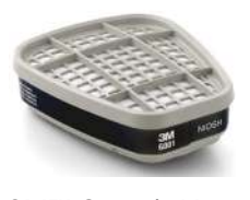
3M™ Organic Vapor Cartridge 6001 Learn more