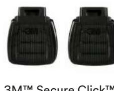
3M™ Secure Click™ Multi-Gas/Vapor Cartridge D8006 Learn more