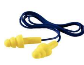
3M™ E-A-R™ UltraFit™ Earplugs 340-4002 Learn more