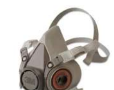
3M™ Half Facepiece Reusable Respirator 6200 Learn more