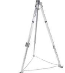
3M™ DBI-SALA® Confined Space Aluminium Tripod 8000000 Learn more