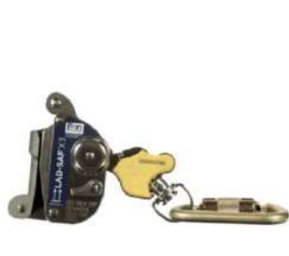
3M™ DBI-SALA® Lad-Saf™ X3 Detachable Cable Sleeve 6160054 Learn more