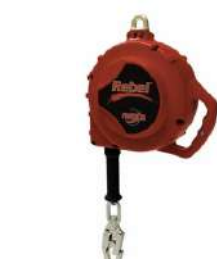
3M™ Protecta® Rebel™ Self Retracting Lifeline 3590628 Learn more