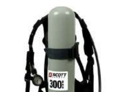
3M™ Scott™ Sigma-2 Type 2 SCBA Learn more