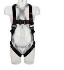
3M™ Protecta® P200 Vest Climbing Safety Harness 1161610 Learn more