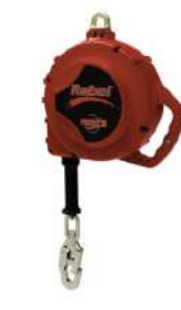
3M™ Protecta® Self-Retracting Lifeline 3590571 Learn more