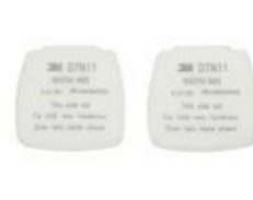
3M™ Secure Click™ Particulate Filter N95 D7N11 Learn more