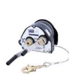
3M™ DBI-SALA® Advanced™ Winch 8518558 Learn more