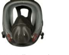
3M™ Full Facepiece Reusable Respirator 6800 Learn more