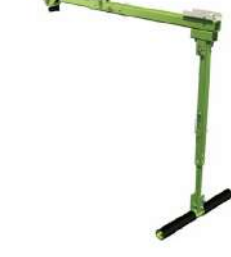
3M™ DBI-SALA® Confined Space Pole Hoist System 8530252 Learn more