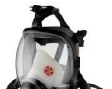
3M™ Scott™ Vision 3 Positive Pressure Facemask Learn more