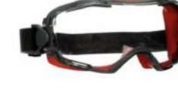
3M™ GoggleGear™ 6000 Series, GG6001SGAF Learn more