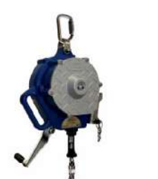
3M™ DBI-SALA® Sealed-Blok™ 3-Way Retrieval Self-Retracting Lifeline with Bracket 3400926 Learn more