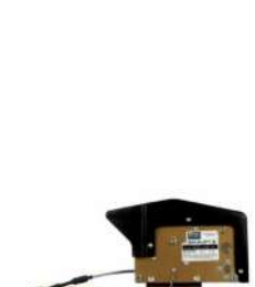
3M™ DBI-SALA® Salalift™ II Winch 8102001 Learn more