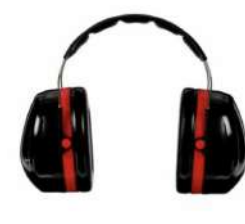
3M™ PELTOR™ Optime™ 105 Earmuffs H10A, Over-the-Head Learn more