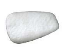
3M™ Particulate Filter 5N11 N95 Learn more