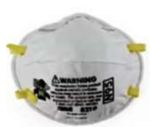
3M™ Particulate Respirator 8210, N95 Learn more