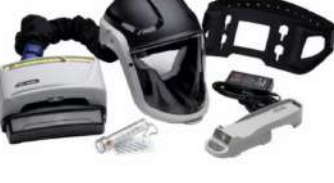
3M™ Versafo™ Heavy Industry PAPR Kit TR-600-HIK Learn more