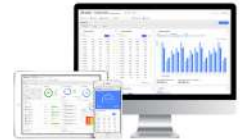
ABB Ability™ Energy and Asset Manager