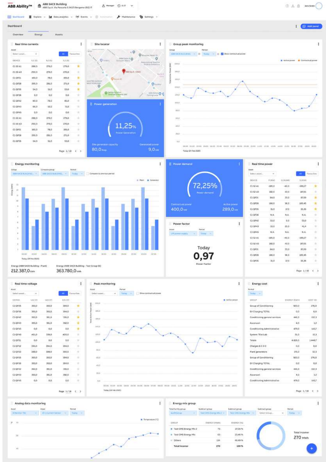
ABB Ltd. Affolternstrasse 41 CH-8050 Zurich Switzerland

solutions.abb/abb-ability- electrification